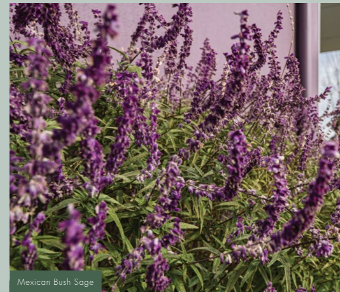
Mexican Bush Sage