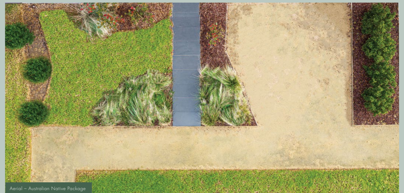
Aerial - Australian Native Package