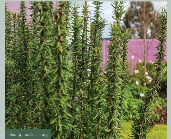
Blue Spires Rosemary