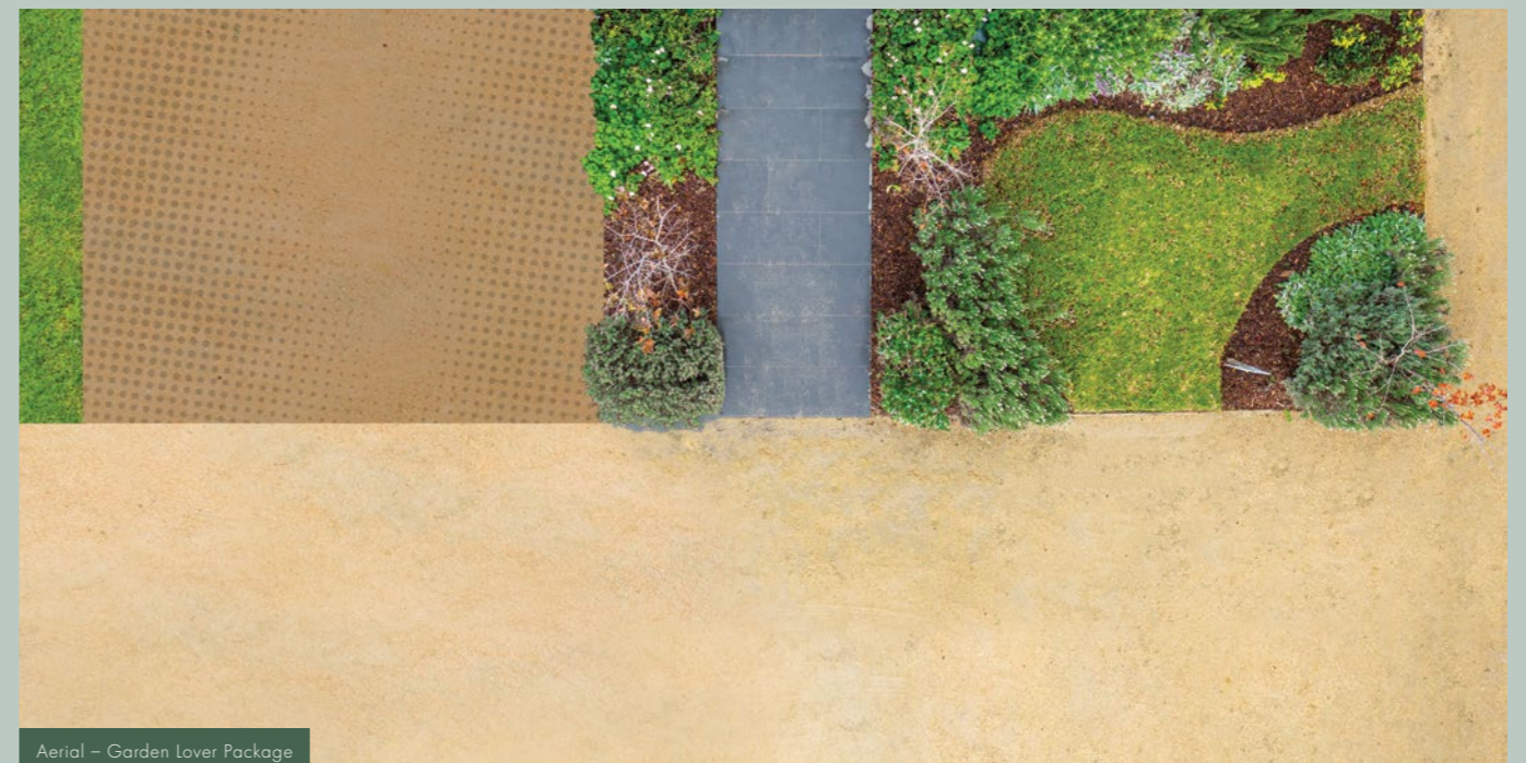
Aerial - Garden Lover Package