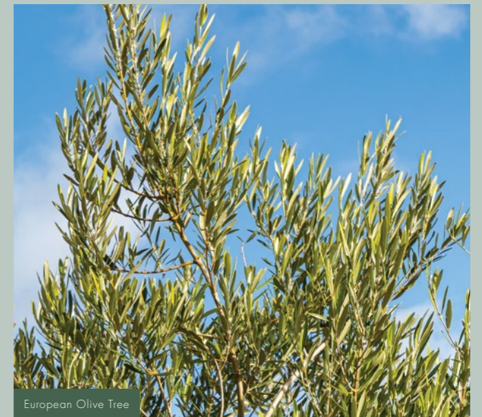
European Olive Tree